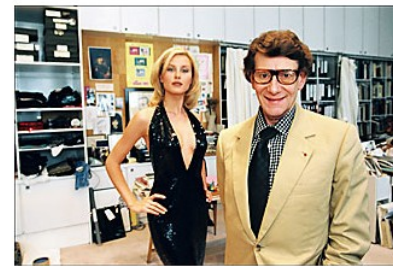
Designer Yves Saint Laurent in Paris in June 1998.